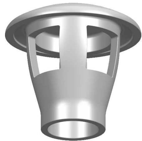
ISOMETRIC VIEW 1:10

WTK EN13502 CE 190 OD 150 ID 385 HT WTK DATE (DDMMYY)