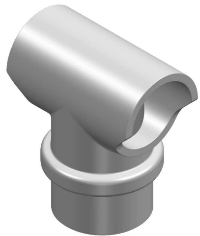
ISOMETRIC VIEW 1:10

RESTRICTED FLUE TERMINAL TO BS EN13502 - TYPE 1