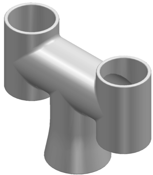
ISOMETRIC VIEW 1:10

OPEN-TOPPED FLUE TERMINAL TO BS EN 13502 - TYPE 0